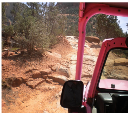
The Pink Jeep Tour takes a small group into the far reaches of the canyons of the Coconino National Forest. It's a rough ride!

An unexpected feature are the custom-made Mickey Thompsons. As you can see, the tire company gets some free advertising on the Jeep itself. This is a new partnership and our driver was very complimentary of the tires. He said the tires take a beating with the additional passenger weight and the rough roads and the Mickeys really hold up. Overall, it was a great trip, and I highly recommend the Pink Jeep Tour.