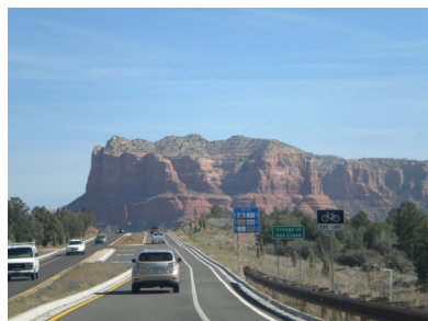
A spring trip to Arizona put us on the road through Oak Creek Canyon up to Sedona.

For our tenth anniversary this past year, I planned a trip to Scottsdale, Arizona for my wife and I. She had never been to the Southwest before and as our anniversary falls in early April, I figured it'd be a welcome respite from the cool spring here.