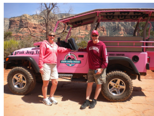
The Broken Arrow "Road" in the Coconino National Forest is co-managed by Pink Jeep Tours. It was a great part of our 10th anniversary trip to Arizona.