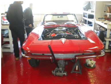
This Vette represents a new trend at White Post, it was in for various minor repairs, not a restoration.