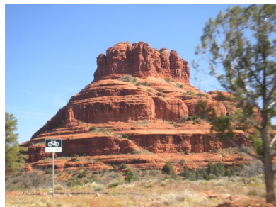
The view from the highway—one word—spectacular. If you've never done it, you must go.

Having lived in Paradise Valley (northeast suburb of Phoenix) for a year in the early 90's, I had made the trek up to Sedona a few times—it's about a 2 hour ride up into the mountains, and there's a winding road up and out of Sedona that leads you to Flagstaff and onto the Grand Canyon.