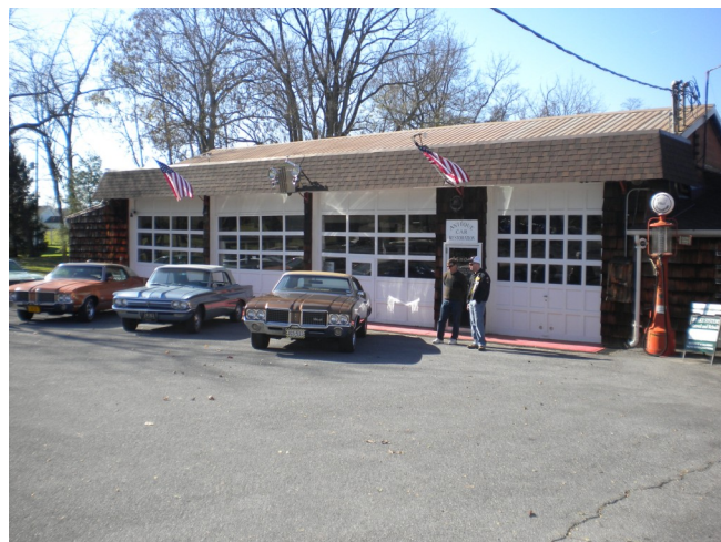
The front of White Post Restorations, in business over 70 years in the little village of White Post, VA, named for a white marble marker from Colonial times.

Editor's Note: Thanks, Ronnie, for setting up the tour and being such a great host!