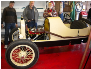
This was the first car we saw as we entered the shop, a one off Ford Model A racer from the early days.