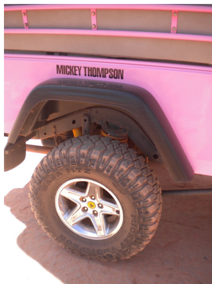
The road sign said "Vehicle Damage is Possible." It's so common Pink Jeep contracts custom Mickey Thompson tires.