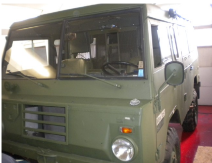
Quite an unusual restoration in a back bay at White Post, a military truck being taken back bolt by bolt to original equipment.

On November 6th, our club was given a tour of White Post Restorations in White Post, VA. The weather was beautiful. Our day started with lunch at Frontier Barbeque in White Post. We had 10 cars and 15 people in attendance.