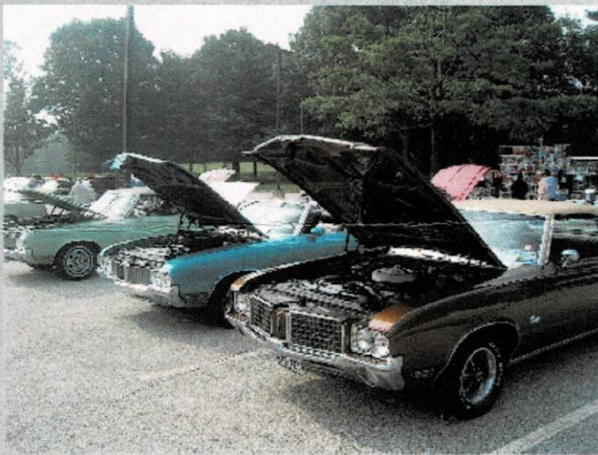
Cars from the 1970's class line up for judging.