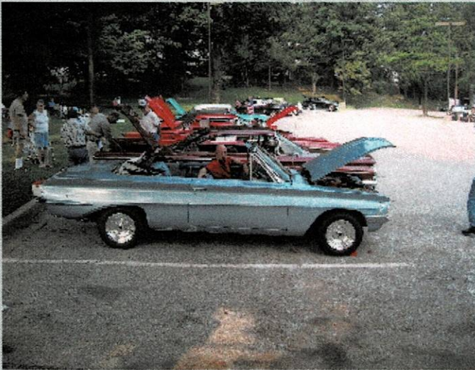
My '62 F-85 Sports Convertible's first show ever