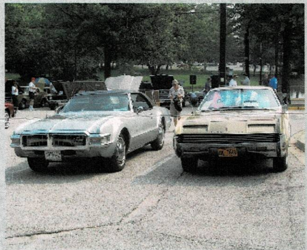
Cory Correll's and Ken Quincy's Toros fill out the class