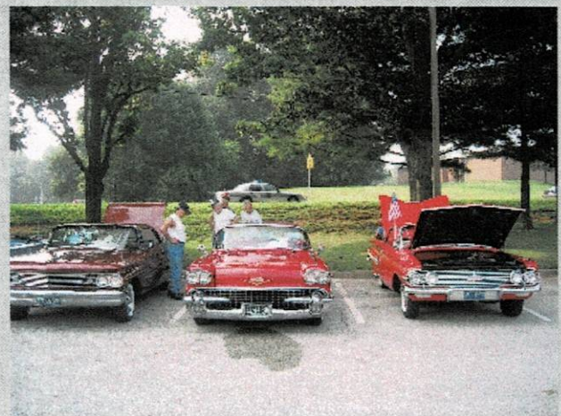
There were 130+ cars registered for the All-GM, including these beauties in the '58-'62 class.