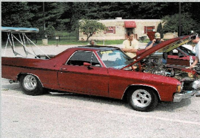
Probably the wildest custom at the All-GM this year, this '69 El Camino with the monster blower surely pumps much HP!