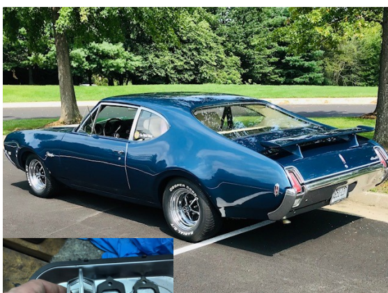
A favorite '69 small part is the raised rear marker light Rocket. New Fusick gaskets were perfect reproductions.