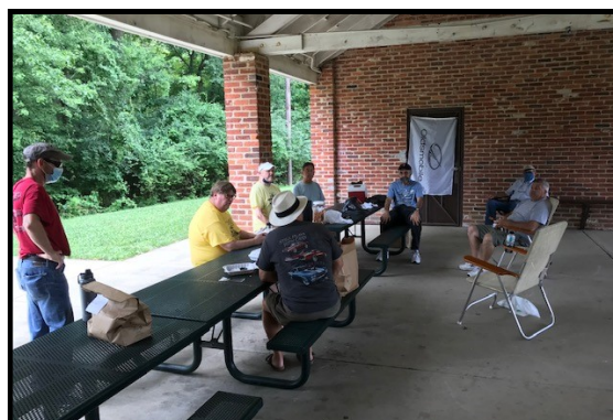
This is what our monthly meetings look like now. We pick an outdoor spot (this is our July 12 meeting in a park across from Hard Times in Rockville), spread out, have some lunch and talk cars.