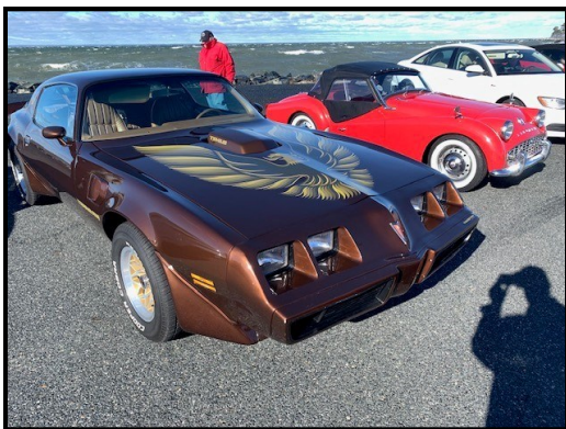
This fine chocolate 1979 Pontiac Firebird Trans Am was in my rear view for 13 miles and drew a lot of attention.