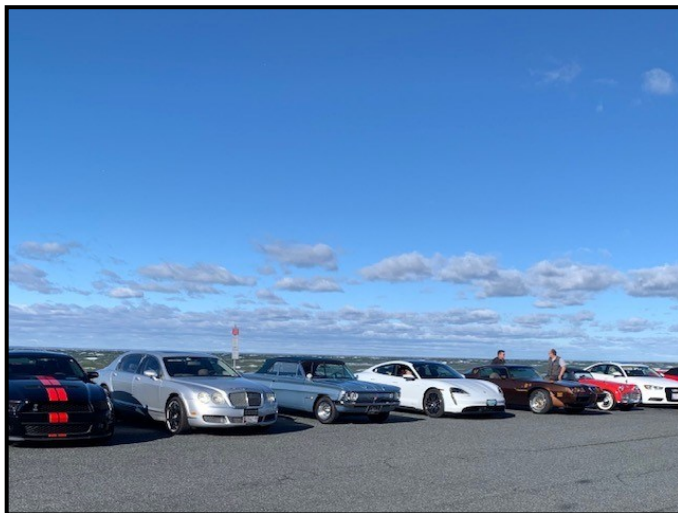
The New Year's Cruise from the St. Michael's Motor Museum leads here to Black Walnut Point. About 40 cars paraded down to the tip of this arm in the bay.

The St. Michaels, MD Motor Museum (see Fall issue of Rocket Review Quarterly ) holds an annual New Year's "cruise to the point" to Black Walnut Cove, about 13 miles south to the tip of Tilghman Island. It's kind of a parade route, and people along it watch and wave as the cars go by. They do a New Year's toast, check out each other's cars, take some pictures, and then head back to the Museum for a pot luck lunch. This year the Motor Museum was especially thankful as between the fall show and this event they had raised the necessary funds to purchase an old gas station on the main drag near the museum, which will be used to educate high school kids in auto restoration.