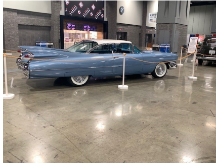
The Cadillac Club again had a WAS presence. A gorgeous '59 was in a lower level local club display.