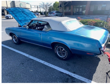
Mark Levine brought out this untouched superb '72 Cutlass convertible. Viking Blue with white top and interior, 350.