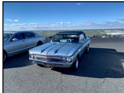
My brother in law's house is about a mile down the road on Tilghman. You can see the whitecaps in the background that kept spraying the cars. It was cold and windy!

The St. Michaels, MD Motor Museum (see Fall issue of Rocket Review Quarterly ) holds an annual New Year's "cruise to the point" to Black Walnut Cove, about 13 miles south to the tip of Tilghman Island. It's kind of a parade route, and people along it watch and wave as the cars go by. They do a New Year's toast, check out each other's cars, take some pictures, and then head back to the Museum for a pot luck lunch. This year the Motor Museum was especially thankful as between the fall show and this event they had raised the necessary funds to purchase an old gas station on the main drag near the museum, which will be used to educate high school kids in auto restoration.