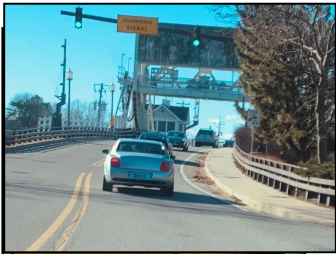
Historic Tilghman Island Bridge crosses Knapps Narrows. Built in 1934, is MD's only heel trunion rolling lift bridge with overhead counterweights.