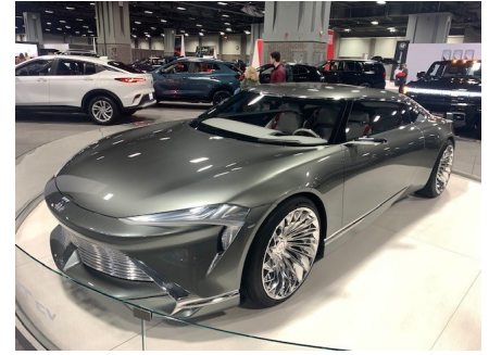
One of our personal favorites was the Buick Wildcat EV concept. "New expressive face of Buick."