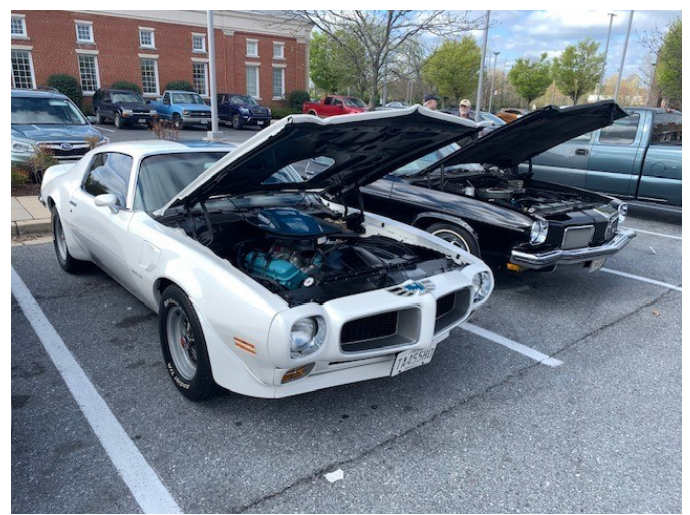
Parked next to the '73 was this super nice early 70's Pontiac Trans Am. It had the 455 H.O. optioned engine and was one of the nicer cars at Burtonsville.