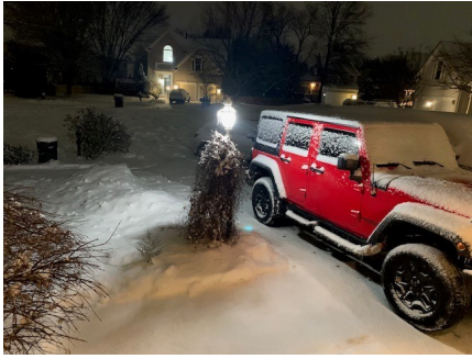
In case you didn't recall, Old Man Winter hit us hard in late Jan/early Feb, as cold & snow rang in 2025.