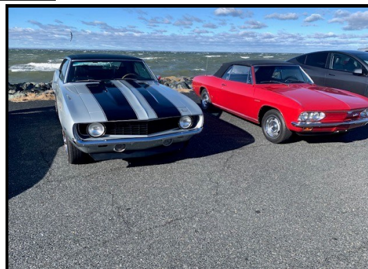
Nice pair of Chevys made the cruise. This clean '69 Camaro and second gen Corvair were both largely restored stock models.