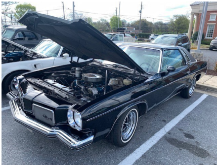
This fine 1973 sported immaculate black paint, clean sorted and correct engine, black vinyl top, and parchment bench seat interior. Sharp!