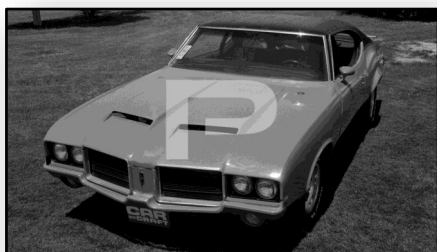
Vintage Peterson Museum pics of Joe's old orange 442 (L) The dual quad-powered 442 in '83 at Super Run, Las Vegas (photos were run in '85 issue of Car Craft )